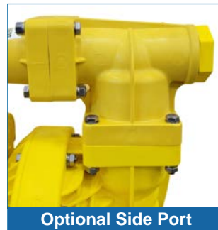
Optional Side Port

Yellow Series General Purpose Nylon Body – Hytrel Elastomers ATEX M2 Rating