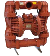
Red Series - P75BR FRAS (Fire Retardant Antistatic) Nylon Body- Hytrel Elastomers- For Explosive Environment- ATEX M1 Rating