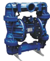
Blue Series - P75BB Polypropylene Body- Santoprene Elastomers- For Acids, Caustics, Chemicals- ATEX M2 Rating